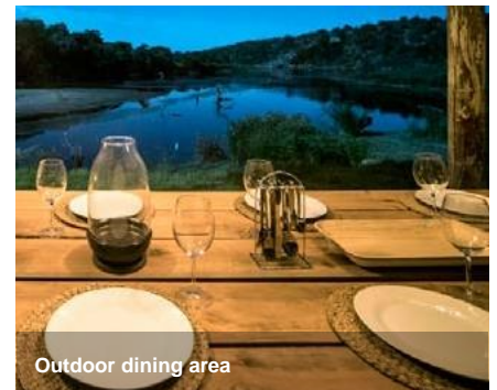
Outdoor dining area