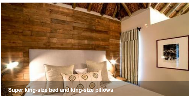
Super king-size bed and king-size pillows