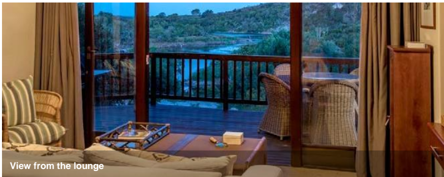
View from the lounge

No large or late parties or excessive noise are allowed.