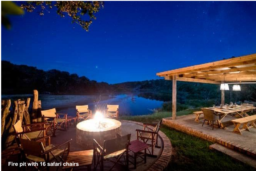
Fire pit with 16 safari chairs