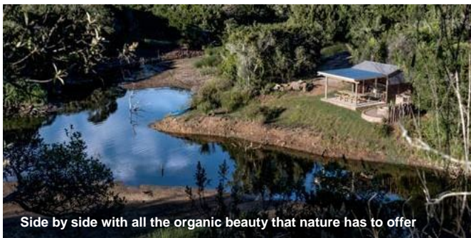
Side by side with all the organic beauty that nature has to offer