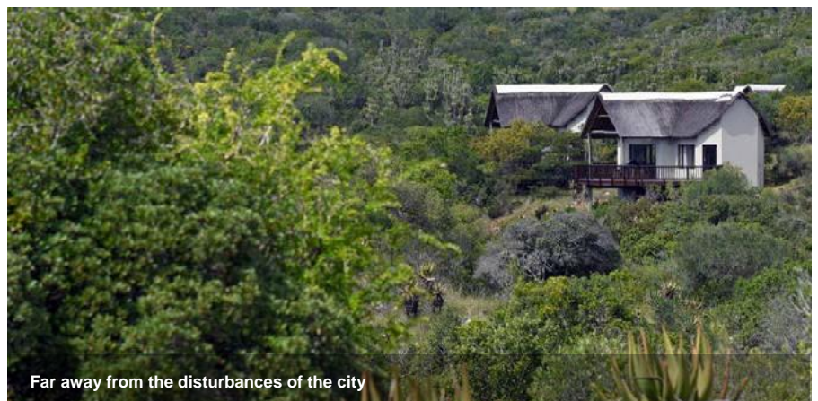
Far away from the disturbances of the city