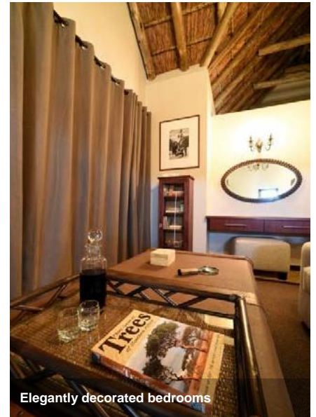
Elegantly decorated bedrooms